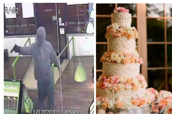
Figure 2: Images from Pinterest collections by a Police department and an image uploaded to a wedding pinboard.

Pinterest is evolving as people construct collections. Our interviews and observations of activity on the site suggest there exists an implicit agreement about what is and what is not appropriate for pinning. Use of Pinterest provided tools like a “Pin It” sharing button on design blogs and e-commerce product pages promote pinning of images from these sites. Yet, this agreement may be unraveling, or at least undergoing substantial changes. There is a growing presence of people on the site who build repositories for purposes other than showcasing beautiful and visually interesting imagery. For example, the Philadelphia Police department posts mug shots and surveillance video of suspected criminals and crimes to support police work. Like-