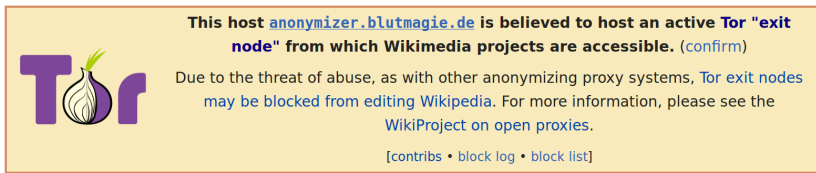
Fig. 2. This banner is sometimes placed on user profile pages within Wikipedia to indicate that an IP address has been the source of contributions by Tor users.

Although Wikipedia allows edits from users without accounts, it systematically blocks edits from users of any “open proxy” system that seeks to obscure locatability by hiding contributors IP addresses—including Tor. The practical impact of this is that if Wikipedia identifies an address as coming from Tor, which it now does with high speed and accuracy, the individual using that address cannot edit or create an account. Tor users also cannot edit using an existing account unless they first generate a strong positive record of editing without the privacy protection of Tor—a very high bar for anyone to clear if they need privacy protection in order to safely contribute at all [47].